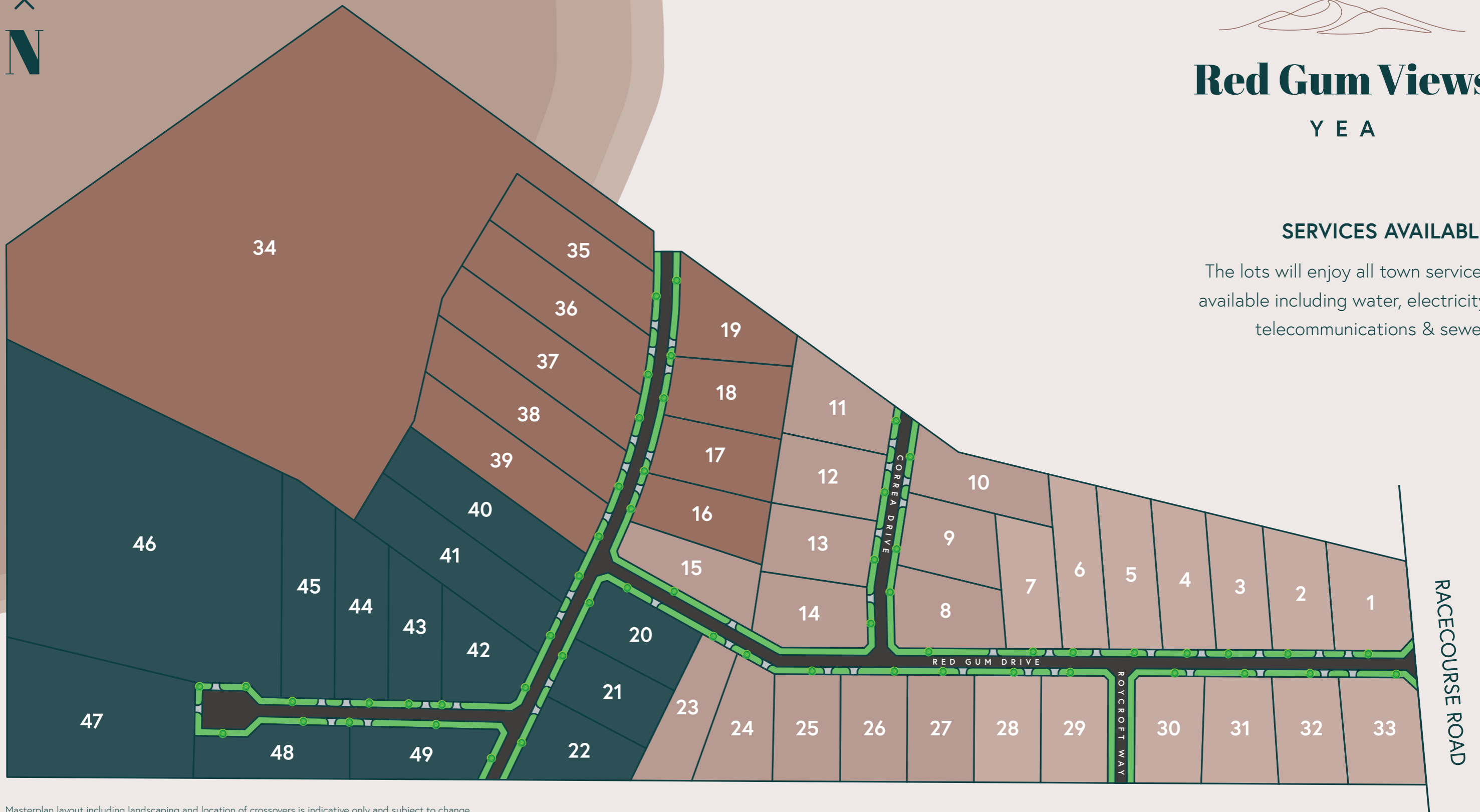
Masterplan layout including landscaping and location of crossovers is indicative only and subject to change

The lots will enjoy all town services available including water, electricity, telecommunications & sewer.