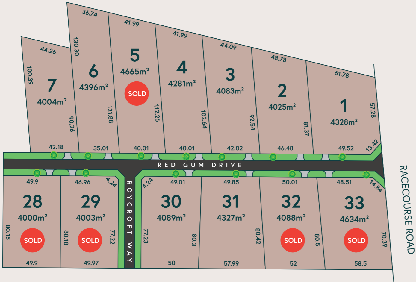
Stage plan layout including landscaping and location of crossovers is indicative only and subject to change